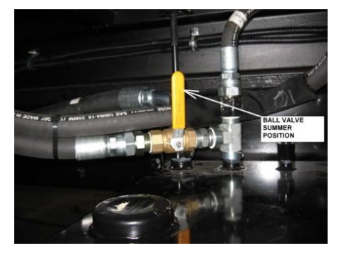
SUMMER - 90 DEG TO HOSE