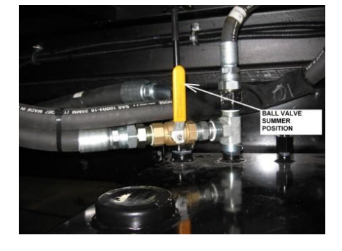
SUMMER - 90 DEG TO HOSE