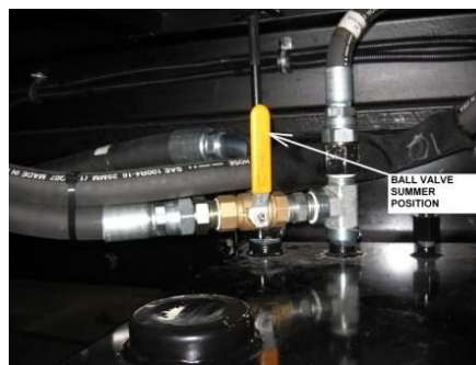
SUMMER — 90 DEG TO HOSE