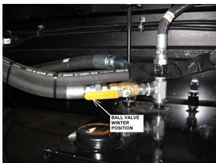
WINTER — IN LINE WITH HOSE

If your Alpine truck is equipped with a cooler bypass valve don't forget to "CLOSE IT FOR THE SUMMER"