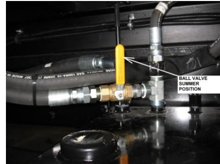
SUMMER — 90 DEG TO HOSE