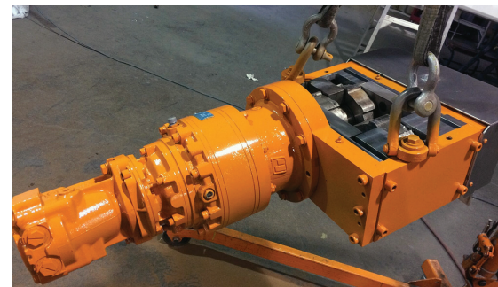
Optional Built in Hard Drive Shredder (available in most models)