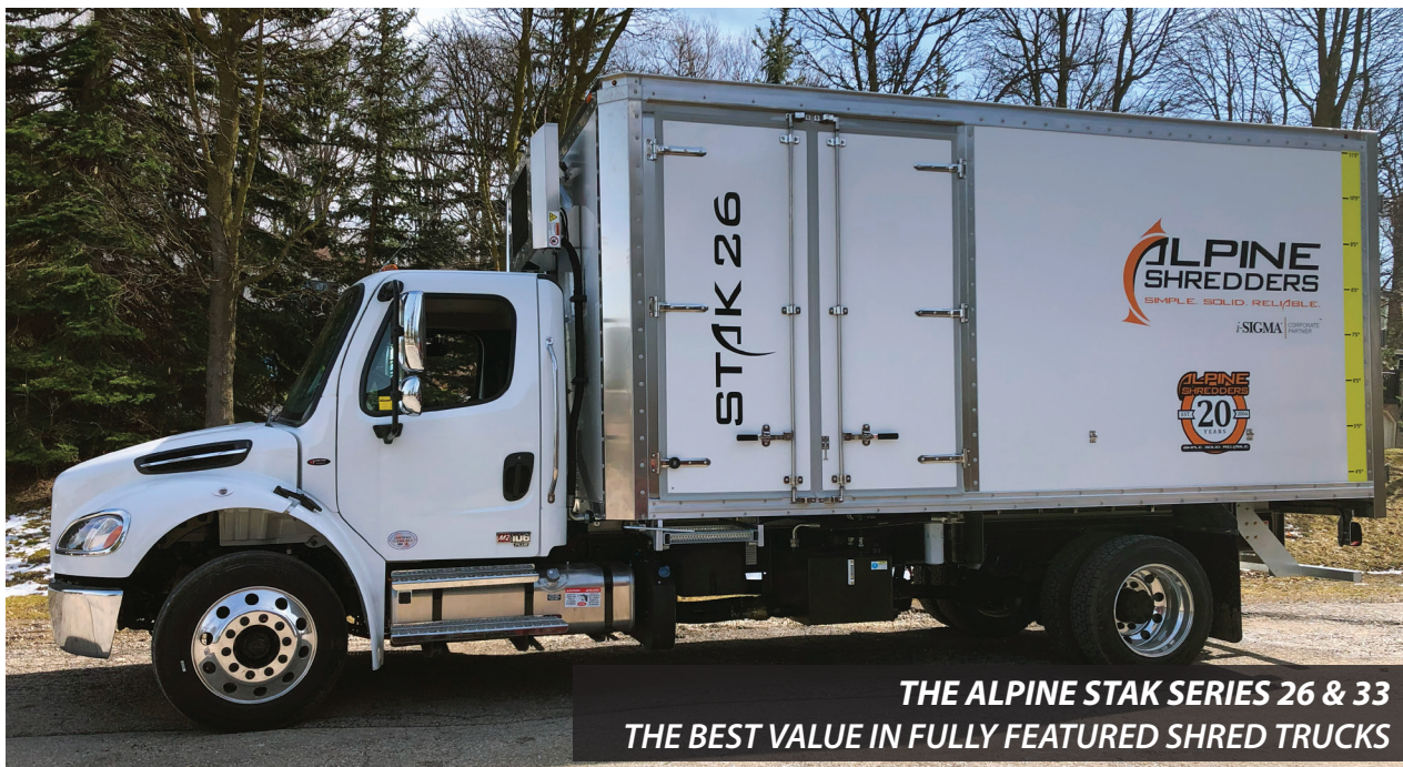
THE ALPINE STAK SERIES 26 & 33 THE BEST VALUE IN FULLY FEATURED SHRED TRUCKS