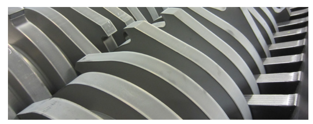
Our solid cutter shaft leads the industry in reliability—engineered to take punishment and keep shredding.