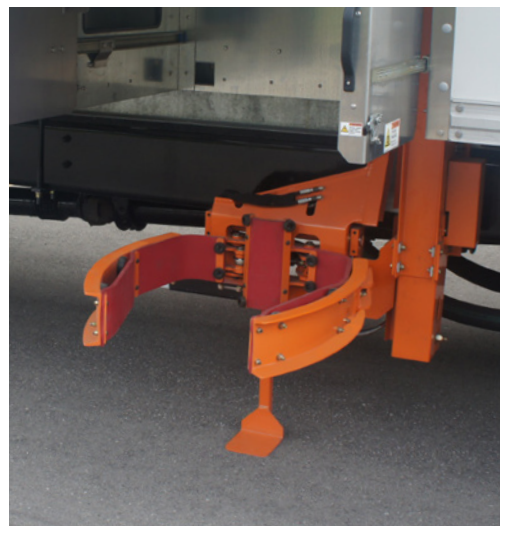
Alpine ShurGrip Cart Lift