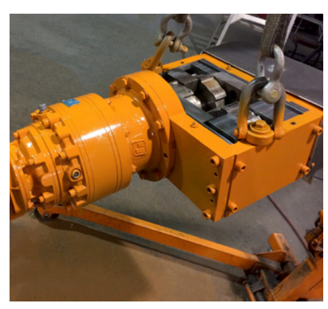
Optional built-in Hard Drive Shredder (available on all models)

The result? A shred truck that's intuitive to operate, easy to maintain, and engineered to last.